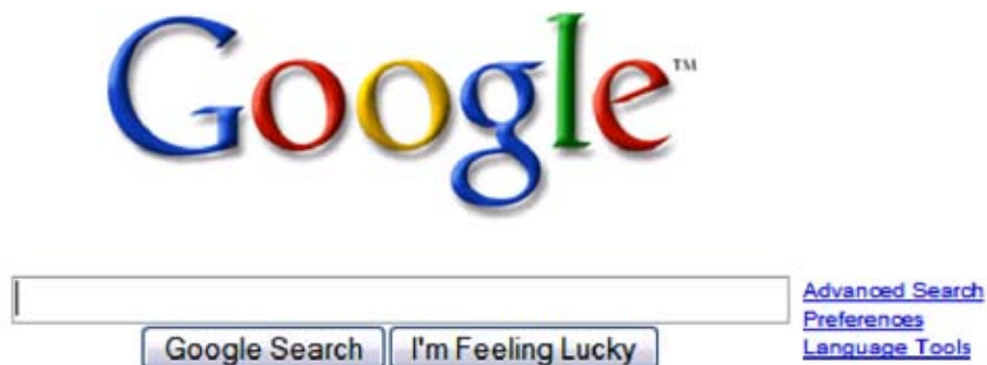
Figure 5: Search engine at www.Google.com

The best way to comb MySpace for relevant information for an investigation is to use Google.com with Boolean and advanced operators (Figure 5). You can search all of MySpace, only blogs on MySpace, or only profiles on MySpace. You can search for particular phrases, include or exclude specific words, and more. See Table 1 for methods you can employ to search MySpace.com using Google.