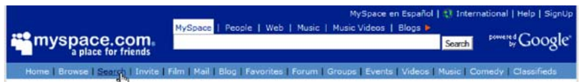
Figure 1: MySpace search feature