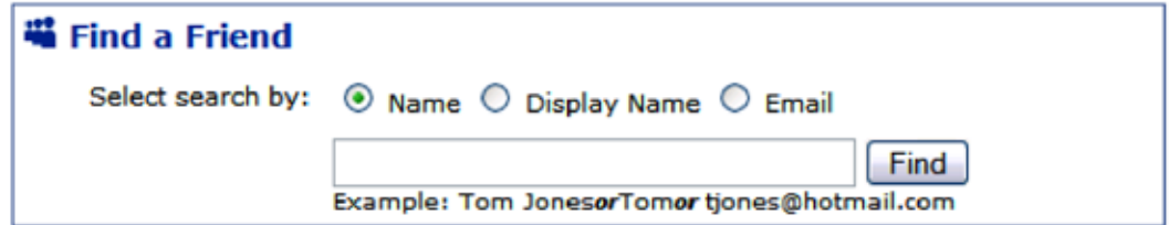
Figure 2: MySpace “Find a Friend” search using name, display name, or email address

The general search engine provided by MySpace (Figure 3) is not particularly useful to investigators who try to find a particular profile based on a keyword. The results of the MySpace search engine are sorted by popularity , not subject relevancy like other search engines. Therefore, the first result will not be the profile that is the most relevant result based on the search terms, but rather the profile with the most “hits” that has one of the search terms in it. A hit is defined as a view of a particular profile. It is most likely that profiles with the most hits will be a popular band or singer or other famous person.